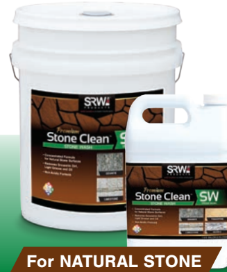
For NATURAL STONE