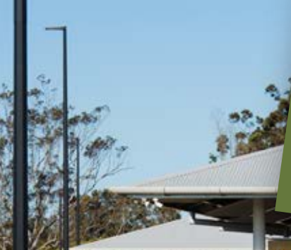
Prestige & Quality Flexible design options Residential & Commercial Landscape Retaining Walls Internal & External