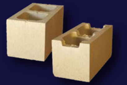
200mm Standard Block 390mm x 190mm x 190mm Pallets mixture of 20-42 & 20-01; Ratio of 3 (20-42) : 1 (20-01) Code 20-42/01