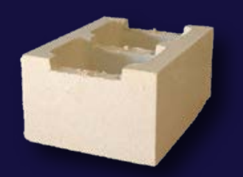
300mm Top Groove Block 290mm x 390mm x 190mm Non stock item, lead times & minimum quantities apply Code 30-42